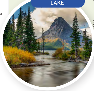
TWO MEDICINE LAKE